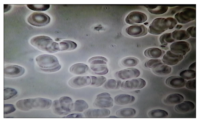
Figure 2: A representative live blood cell imaging of the same subject 5 min after consuming water.