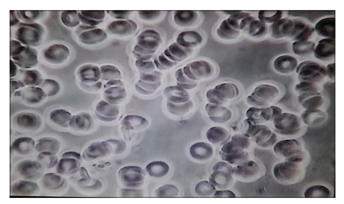
Figure 1: A representative baseline live blood cell imaging before consuming water.

that the iron-free VMP35 produced adequate nutritional benefits to restore intracellular iron-dependent RBC Hb within 5 min of intake, which was further sustained for an extended period. In addition, neutrophils demonstrated